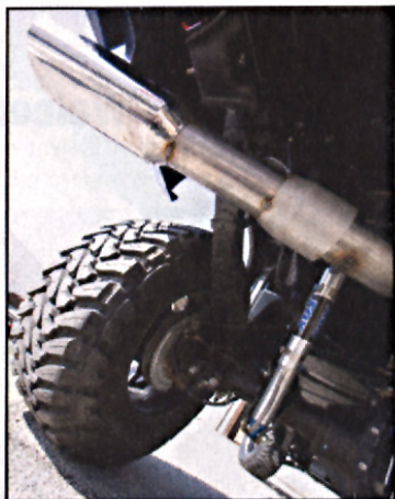
In the back, a set of springs from CST and matching Fox shocks provide plenty of travel.