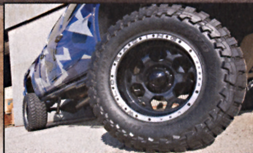
Before you ask, the cool looking wheels are Methods from Weld Racing, and are 20 inches in diameter. The rolling stock is a set of four 38-inch tall, 15.5 inch wide Toyo Open country MT's.