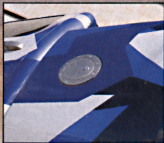
In addition to the paint, many other cool touches have been integrated into the design, such as custom door handles and this billet fuel cap. The finish is called "gun metal," and the pieces were custom made by IAG.