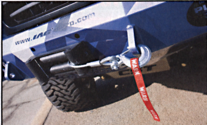
Front and rear Road Armor bumpers and Warn winches were added. By adding these, the truck is better protected when it goes off road, and it also can winch itself out if it ever gets stuck.